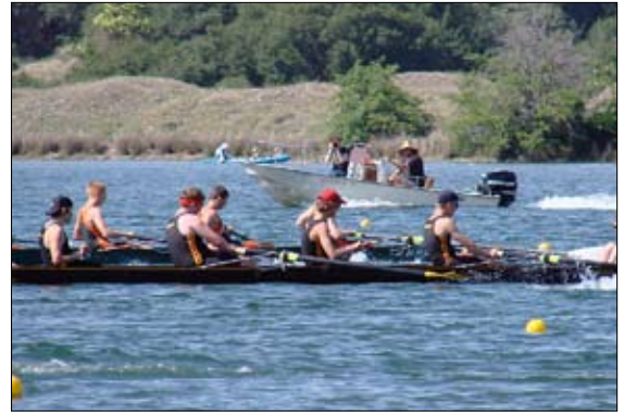
Berkeley Men's Freshman 4+ dueling for first place in their CJs heat

BHS athletes rowed well all weekend long, but fell repeatedly to the stronger clubs. The men's frosh 4 boat improved its time in Sunday's final, but was unable to medal. The women's pair came within 2.5 seconds of moving on. The men's